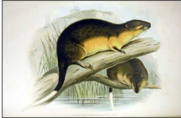
Native Water Rat. Painting by John Gould 1863 ©Museum of Victoria it

This beautiful animal is our native Water Rat. Though seldom seen, it occurs throughout Victoria and much of Australia, except for the arid interior. It is the largest of about 50 native rodent species surviving in Australia today (several species have become extinct during European history). Males can weigh up to 1.2 kg, though females are a little smaller.