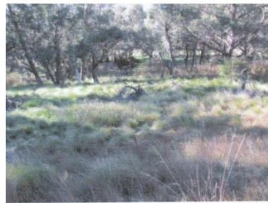
Swampy Riparian Woodland in moderate/good condition