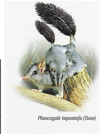
Phascogale tapoatafa (Tuatara)