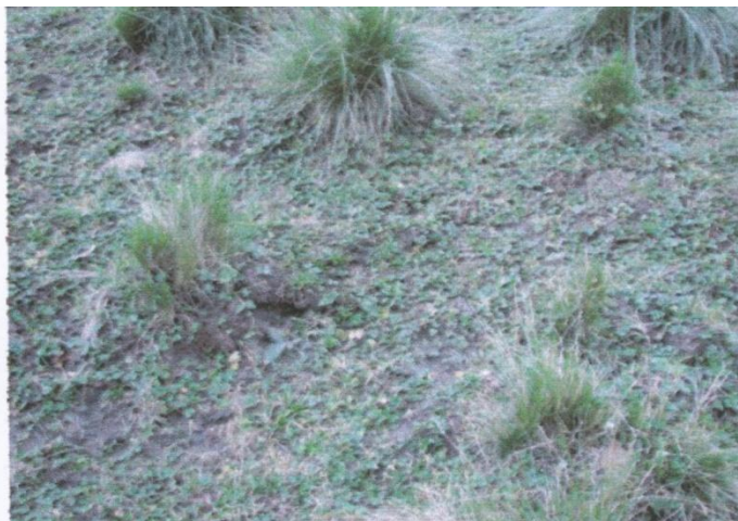
Invasive buttercup spreading within overgrazed grassland