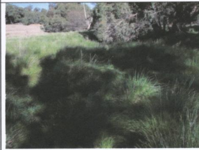
Typical poa grassland in moderate/good condition