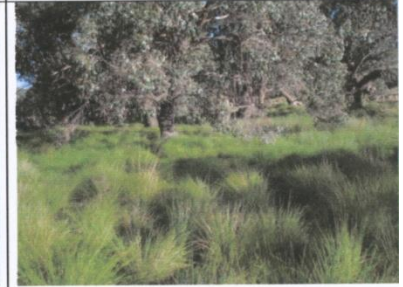
Healthy poa grassland