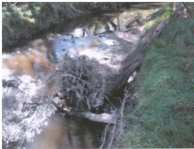
Streambed development occurring d/s of rootball