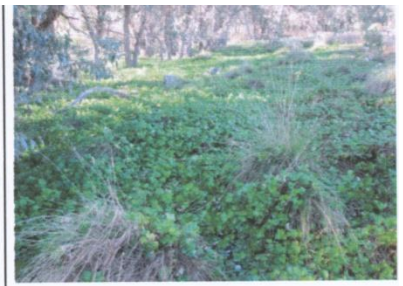
Ground flora dominated by introduced species (buttercup)