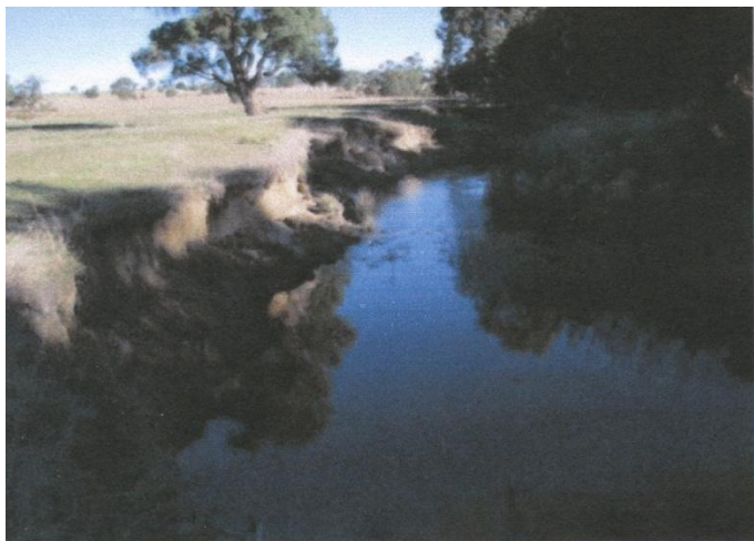
Typical bank instabilities due to degraded/absent riparian vegetation p Stock

increased severity of drought, flood, storms and wildfire degrading stream flows.