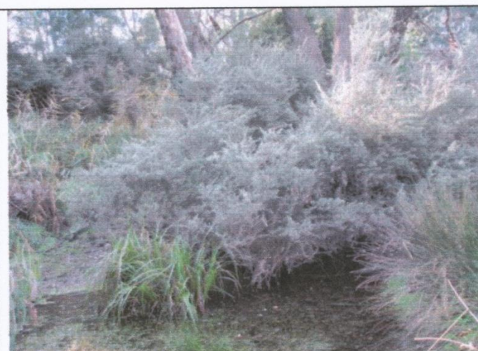
Woolly tea-tree (a rare occurrence)