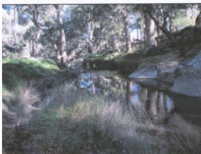
Long pool with good habitat values