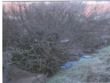
Willow encroachment near Strathbogie township