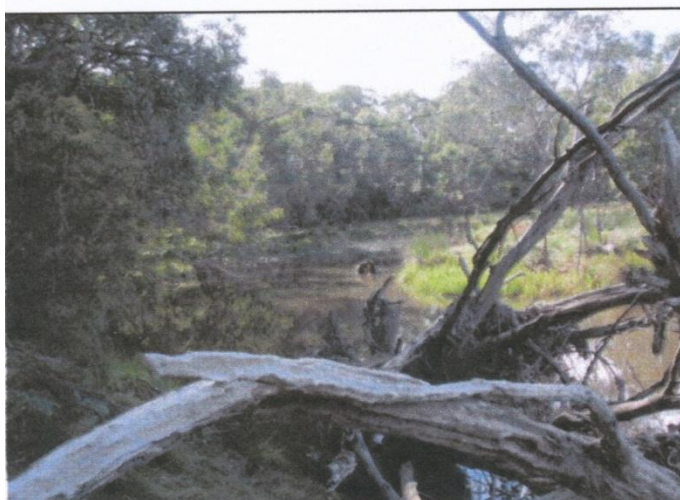
Backwater from Polly McQuinns Weir