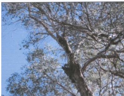
Hollow-bearing trees providing native fauna habitat