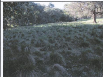
Cattle grazing pressure on poa grassland