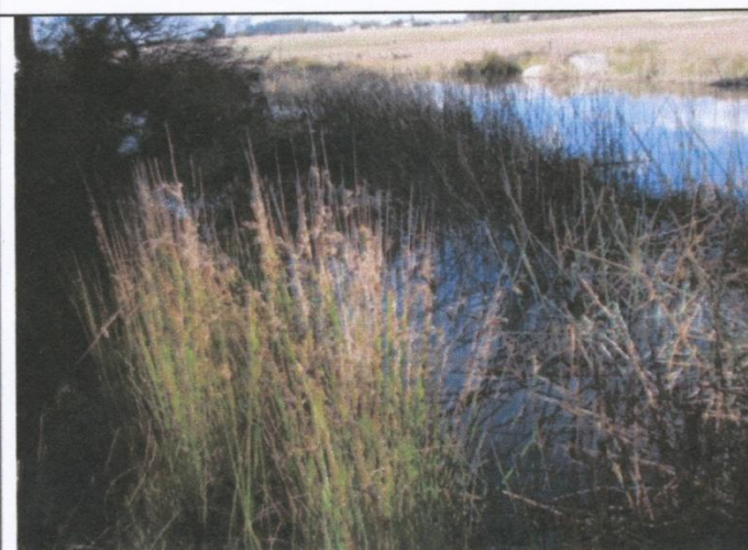
Waterbird habitat – rushes and spike-reeds