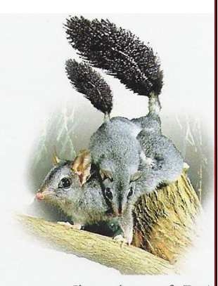
Phascogale tapoatafa (Tuan)