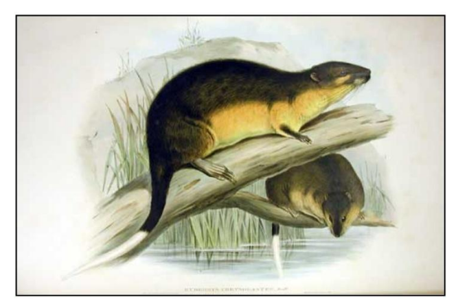
Native Water Rat. Painting by John Gould 1863

I recently disturbed a Water Rat at the carcass of a fresh Wombat road-kill under Smiths Bridge, Strathbogie. After eying me off for a few seconds, fled into long grass on the bank of the Seven