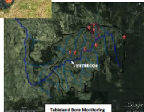
Tableland Bore Monitoring