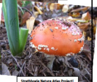
Strathbogie Nature Atlas Project!