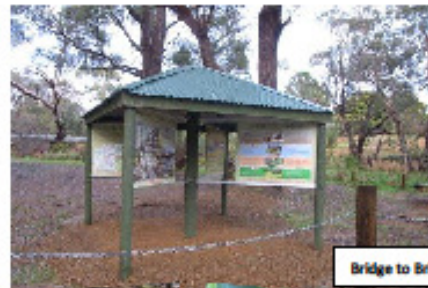
Bridge to Bridge