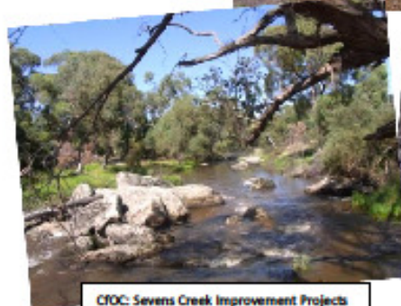
CfOC: Sevens Creek Improvement Projects