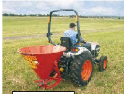
Alternate Fertiliser Trials