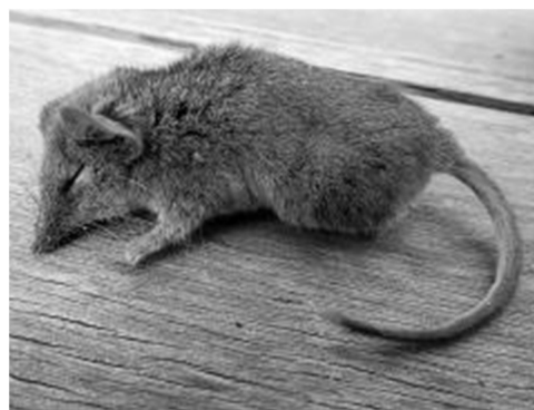
Above - The Agile Antechinus is common in the Strathbogrie Ranges, wherever there is dense undergrowth and forest leaf litter.

Mating is highly synchronous and occurs in a two-week period in August-September and all females within a population give birth within a couple of days of each other. Then, with their work of fertilizing the females complete, all males die within the next week to ten days, leaving the Agile Antechinus populations all over Australia composed entirely of adult females, until those females give birth to 6 to 10 young about one month later, in September-October. Some females may live to breed the next season, if they don't fall prey to owls and other predators. A hectic lifestyle indeed!