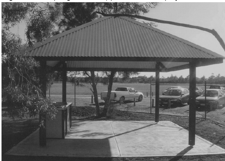
Above—example of a similar structure to that proposed.