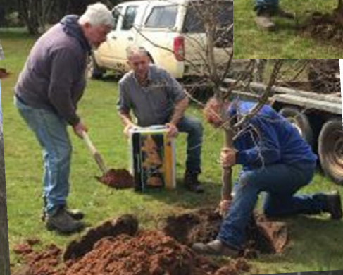
Photos from the community working bee held in September