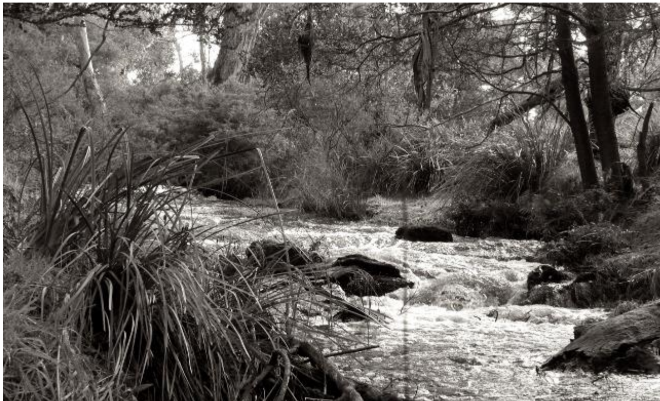
Rapids along Magiltan Creek

RSVP for catering - Sean 0400 019 607, or Bert 0409 433 276