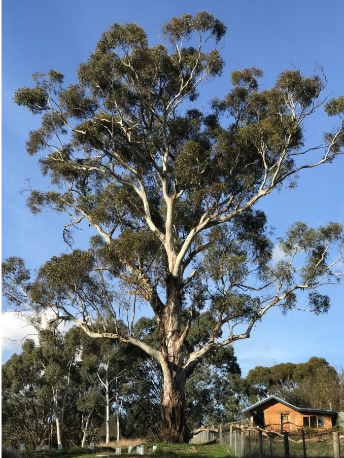
A late afternoon photo highlights trunk, foliage and scale.