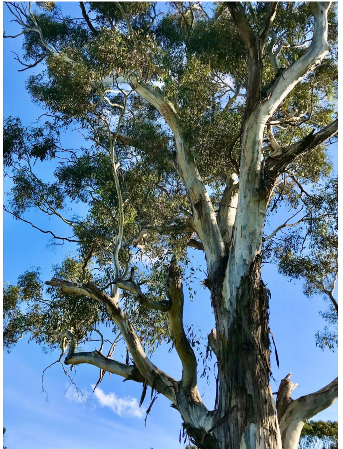
There are many hollows, often occupied by native animals.